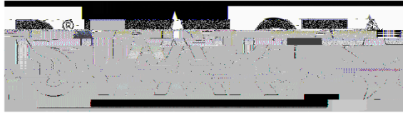
State of Texas Assessments of Academic Readiness